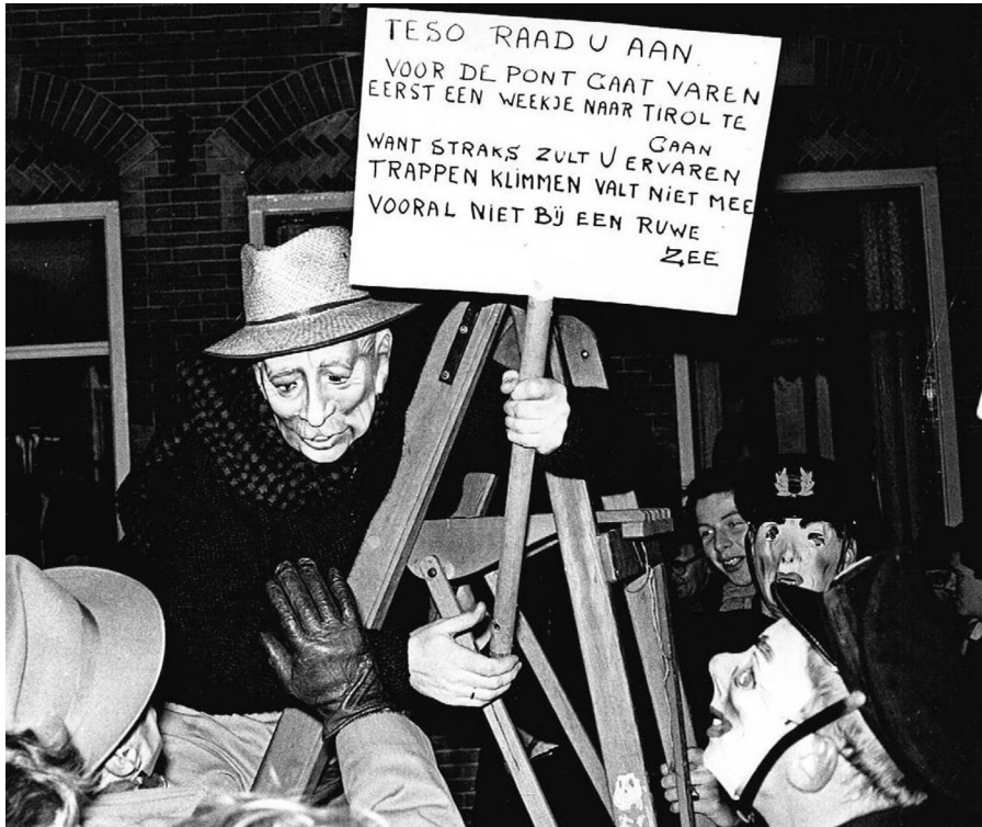
Figure 3.2 Texel's Own Steamship Enterprise as a popular theme

This photograph shows players in a 1963 performance who criticise the relocation of the ferry harbour. They poke fun at the island's new double-decked ferryboat and the ferry terminal, which has a flight of stairs to reach the boat's upper deck. The text reads: 'TESO advises you to go to Tirol for a week before the ferry starts sailing for you will experience that it's hard to climb the stairs particularly with a rough sea.'