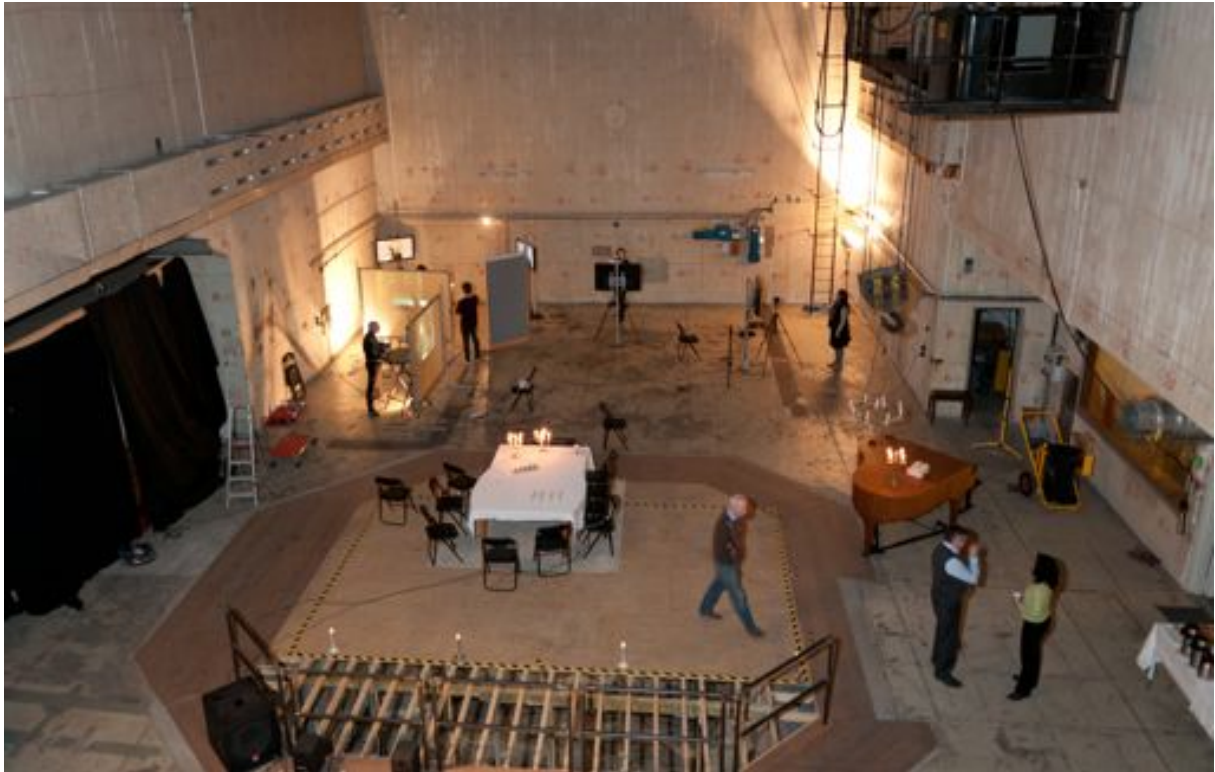
The EIT ICT Labs Presence Lab 2012, KTH Campus